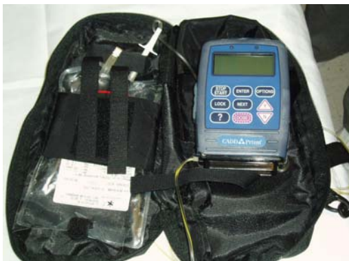
IV Bag is hooked to Infusion pump and able to be carried in a carrying case with a strap.